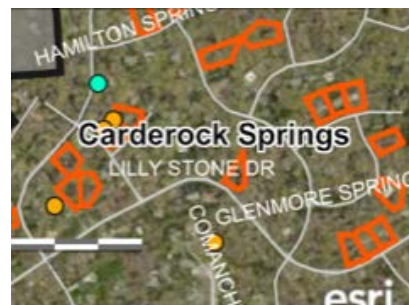
Local Projects for Conservation Gardens and Rain Gardens

Carderock Springs has been designated an official Montgomery County Rainscape Neighborhood . REBATES for rainscapes that get preapproval from Montgomery County are $2500. Grants could cover much or all of the cost of a project. The Talisman garden will be open for a spring 2019 tour.