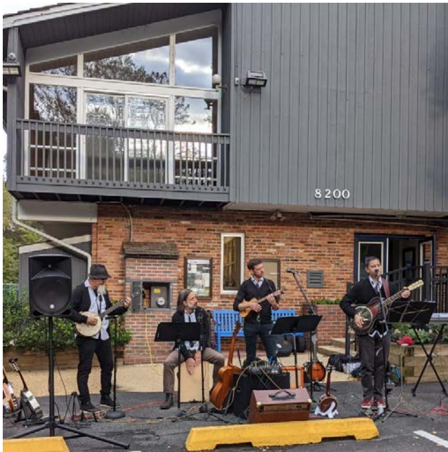
Left: The Band