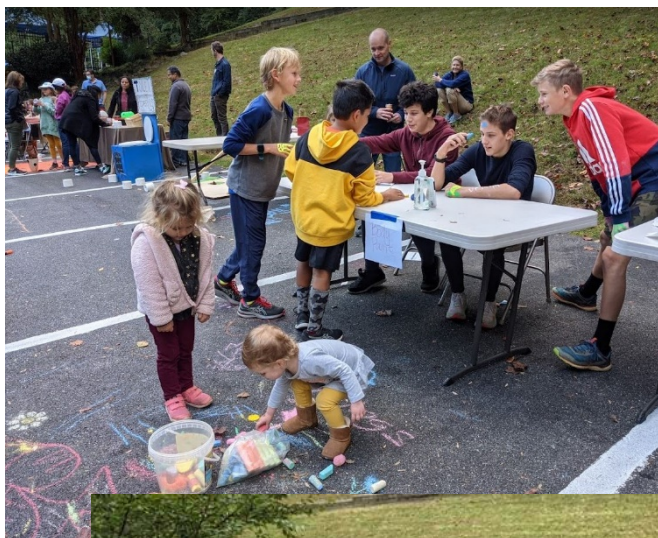
Left: Kid Games, by kids and for kids (Yes that's the much-loved Toilet Paper Toss in the background)