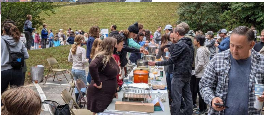
Below: Chili Contest!