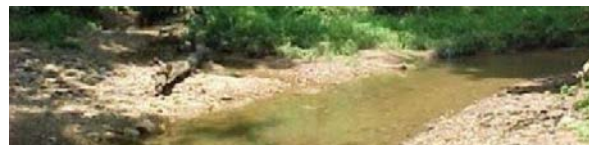
Cabin John Creek