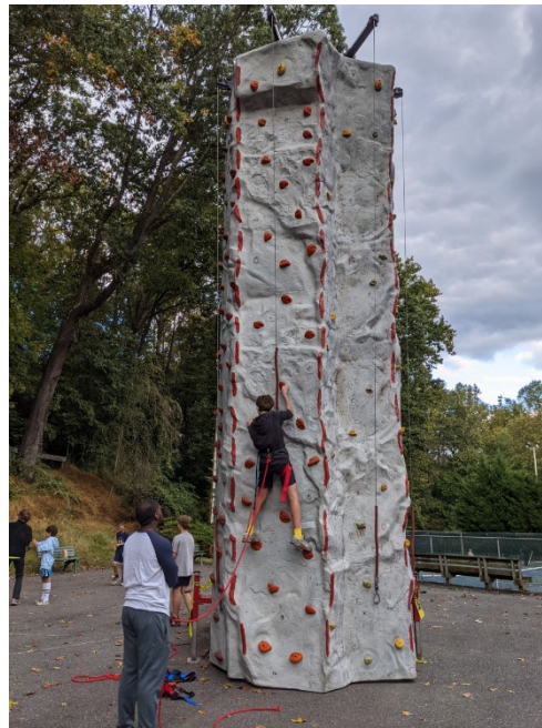
Right: Climbing Wall