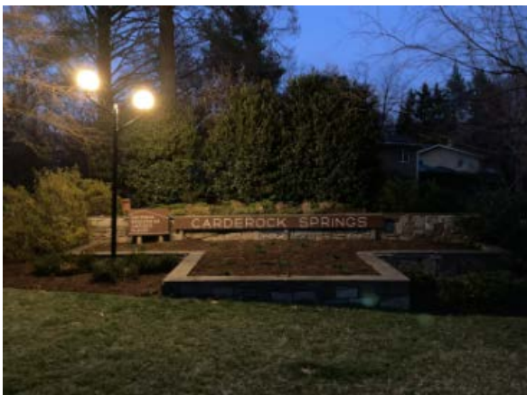
The newly repaired globe lamppost at Lilly Stone Dr. and Persimmon Tree Ln entrance.

Note: A color temperature of up to 3000k would still maintain the desired warm glow effect from your globe, but anything higher (e.g. 4000k, 5000k, “Cool White”, “Daylight White”) starts to give off a less-welcoming, industrial feel.