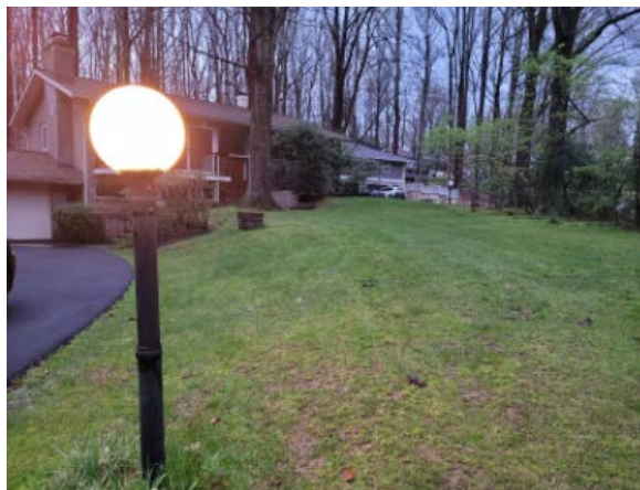
An illuminated outdoor globe lamppost at 8212 Hamilton Spring Ct.

In writing this piece, I learned that the globe-style light was popularized by Joseph Eichler, an influential modernist real estate developer based in California, during the 1950's and early-1960's. (Warning, 100% conjecture ahead!) It's likely that Edmund Bennett was at a minimum indirectly influenced by Eichler's globe design since Carderock's mid-century modern homes also came standard with indoor globe lights. The mass outdoor adoption of globes by homeowners is potentially explained by a desire to update their lampposts in the mid-century modern style. If you have additional information (factual or anecdotal) about the history of globe lights in Carderock Springs feel free to share using the email address in the byline.