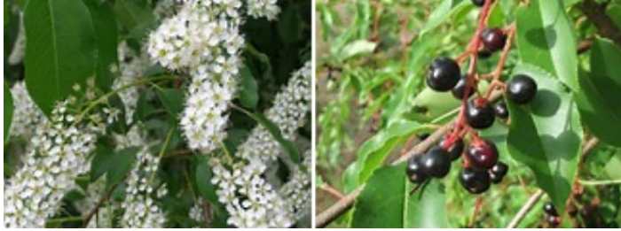
Native Black Cherry tree

The native dogwoods and redbuds have put on an incredible show in Carderock for the last month. The cool weather extended the lovely white and purple blooms in yards and in our wooded areas. For May, look for the long, wavy, and scented white flowers of the native black cherry, and the white blooms of the less common Washington Hawthorn.