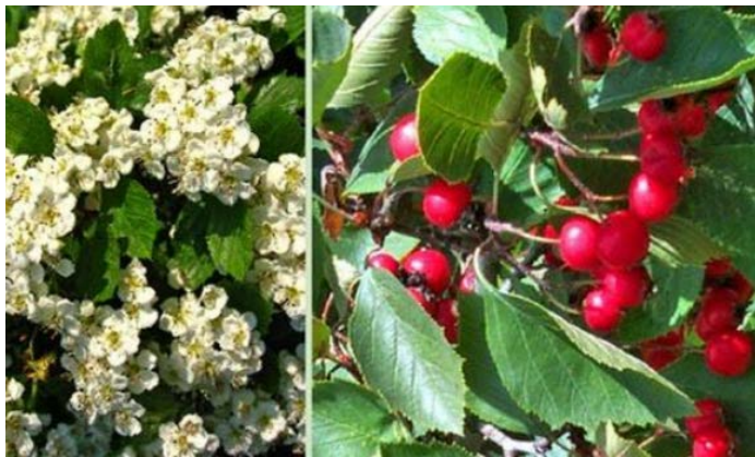
Native Washington Hawthorn tree

The native dogwoods and redbuds have put on an incredible show in Carderock for the last month. The cool weather extended the lovely white and purple blooms in yards and in our wooded areas. For May, look for the long, wavy, and scented white flowers of the native black cherry, and the white blooms of the less common Washington Hawthorn.