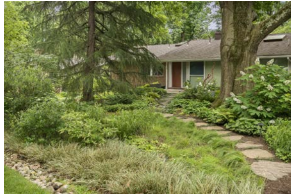
Native plant gardens

In small open areas, even under trees, native sedges make a nice carpet that suppresses weeds. Native sedges and grasses can define the edge, or transition from planting bed to lawn. They make a nice base layer in a rain garden, providing texture and color when all the wildflowers are gone. Many are great in wet areas, soaking up water much better than turf grass. Plants that grow tightly, as in a native meadow, help each other thrive by keeping in moisture and keeping out weeds.