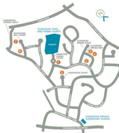
Map of 2023 House Tour

Also, this year's attendees will be receiving an online survey about your house tour experience to improve future tours so watch for that survey.