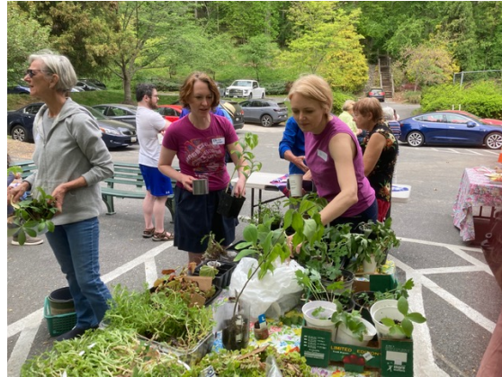
Photos from April Cuppa with plant exchange