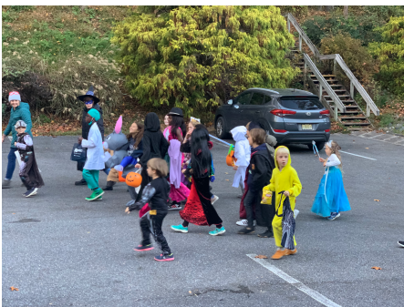
Arch

Monthly CSCA Board Meeting http://carderocksprings.net/zoom